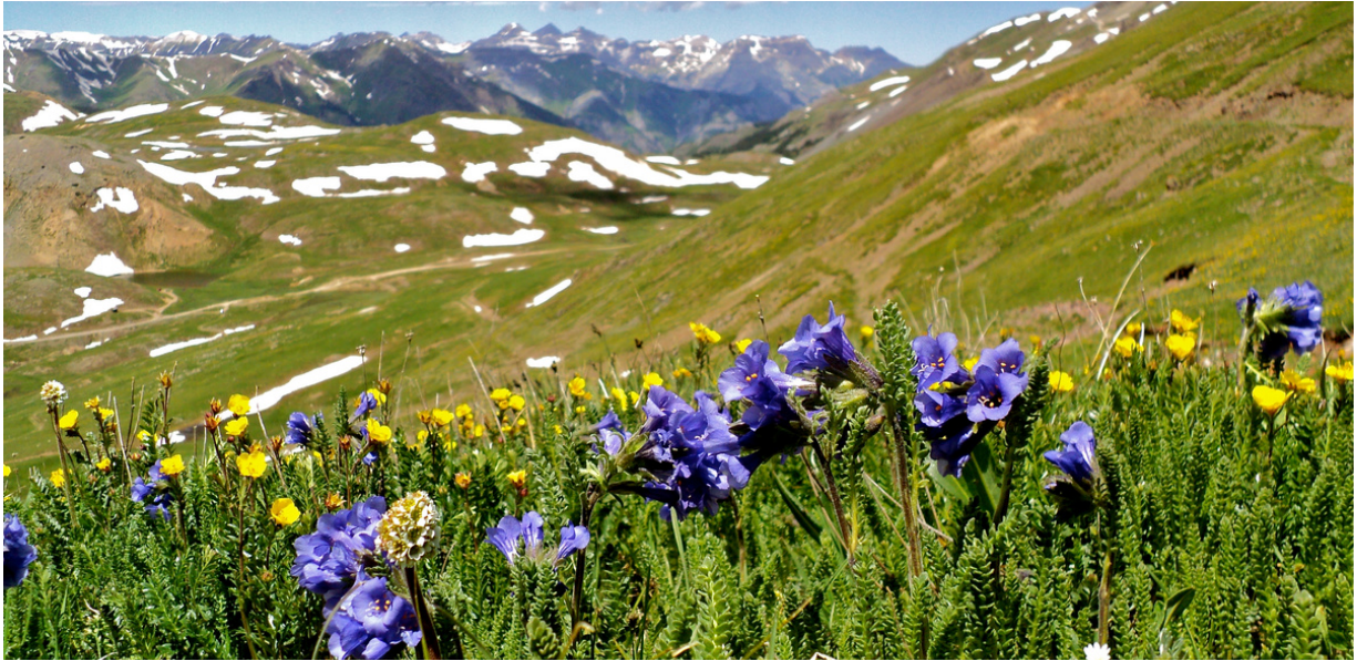
Springtime in the La Plata Mountains