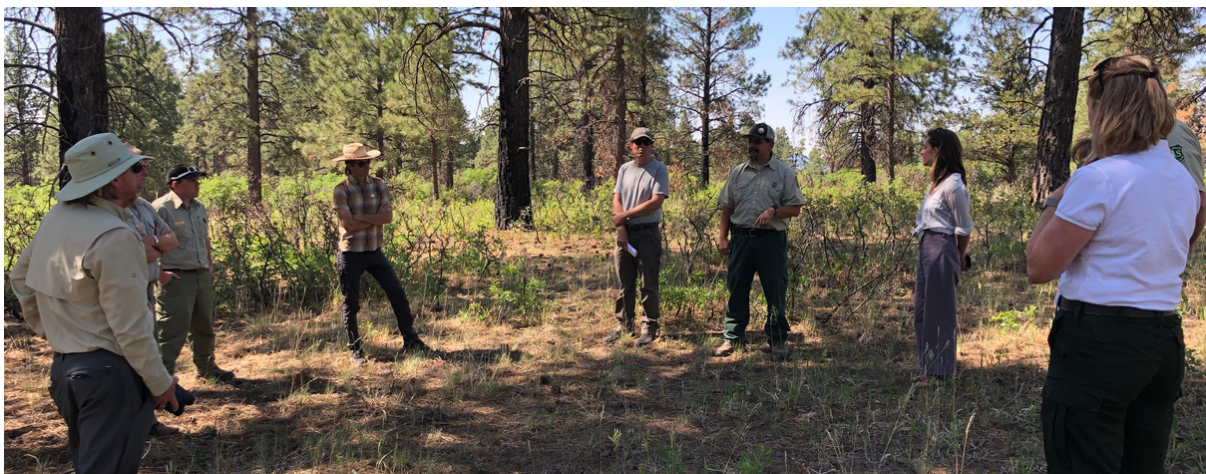
Field day with Congressional Staff on the Dolores Ranger District, 2021