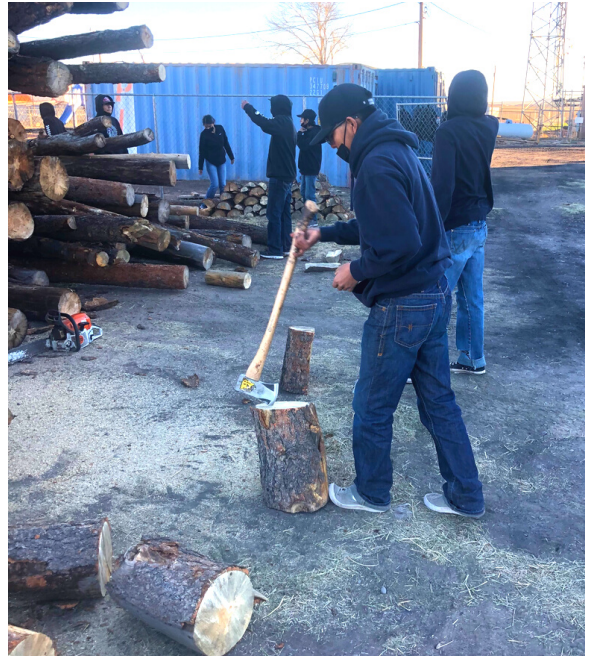
A Tribal Americorps crew processes the firewood