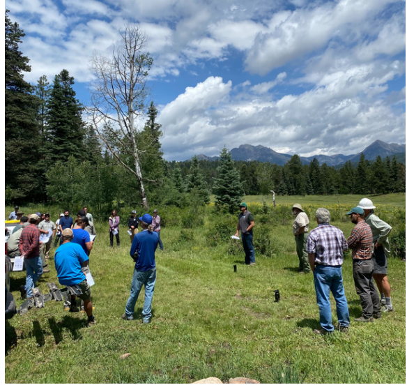
Fall, 2020 Headwaters Collaborative Tour.