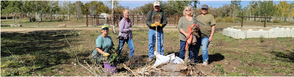
Mesa Verde Backcountry Horsemen during the 2020 National Public Lands Day cleanup

An important element we want to highlight in this newsletter is our commitment to our partners.