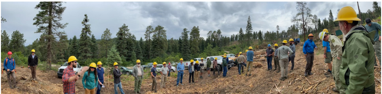
June 2021 Headwaters Collaborative Tour.

Sign up to be notified of the Jackson Mountain Open House dates and locations here!