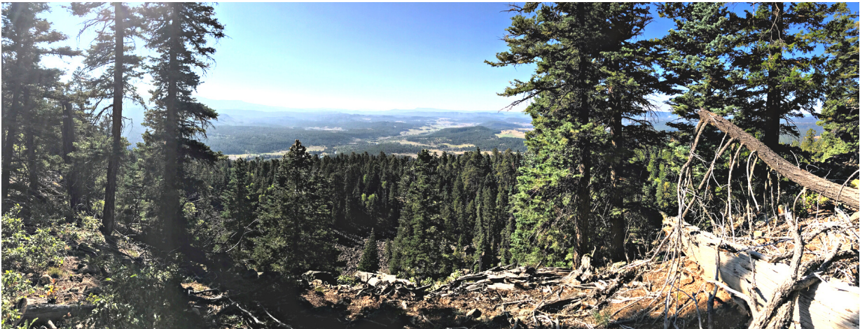
View from Jackson Mountain