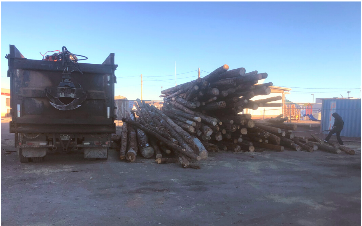
The Chinle Chapter House receives its first wood delivery.