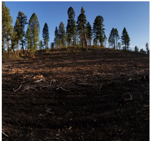
Jackson Mountain vegetation treatment