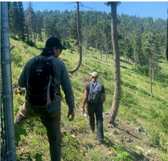
IMBA representatives collecting info for the conceptual trail plan, Summer 2021.